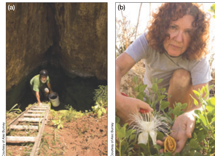
Figure 4. (a) DAB climbs out of a deep pit with a bucket of excavated sediment containing bones, shells, seeds, and other fossils from extinct and endangered biota of Kauaʻi. (b) LPB harvests a seed pod to grow more maiapilo , or Hawaiian capers ( Capparis sandwichiana ), common as a fossil in the Makauwahi Cave sediments and still growing nearby today. These plants are featured in the restoration unit above the cave because experts on the blind cave biota have found that nutritious exudates on the roots of this plant, which extend into the cave environment, form the base of the troglotic food web.

itor the site's airborne particulates in a range of environments.