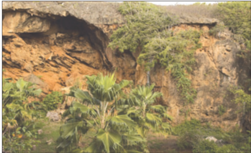
Figure 1. View of the western wall of the large sinkhole in the center of Makauwahi Cave. Pritchardia aylmer-robinsonii palms in the foreground, although extinct on Kaua`i today, were reintroduced to the site from the adjacent island of Niihau because their seeds and pollen were abundant in the pre-human sediments excavated from the site.

Multidisciplinary studies at Makauwahi Cave, Maha`ulepu, on Kaua`i’s south shore (Figure 1), first revealed some critical details needed for restoration on the dry, leeward side of the island (Burney et al. 2001). Pollen and plant macrofossil results showed unequivocally, for the first time, that pre-