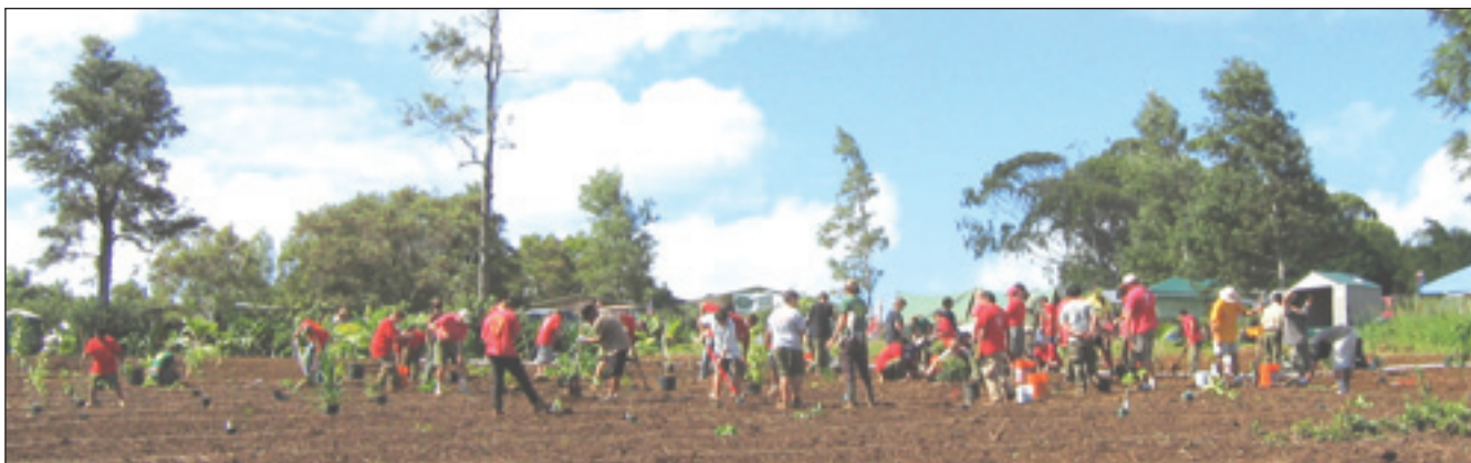
Figure 5. At the Grove Farm Ecological Restoration on Kilohana Crater in eastern Kaua`i, hundreds of local Scouts and middle-school students have participated in large-scale inter-situ native plantings guided by paleoecological records of past vegetation nearby.

In addition to native plants, some restoration sites contain areas that target not pre-human Kaua`i, but early Polynesian times, as a reference system for restoration. At Lawai-kai, for instance, the stated goal of the restoration project is to reconstruct the plant community, inferred from fossil pollen and seed studies in the area, as it might have appeared shortly after Polynesian arrival. Thus, some restorations feature plants believed from the fossil and archaeological record, and generally confirmed by traditional lore, to have come in the double-hulled canoes of the founders of the Hawaiian people. Of special interest in this regard are projects that focus on ex-situ or inter-situ preservation of old Hawaiian cultivars or landraces of breadfruit, banana, coconut, sweet potatoes, and that key Polynesian staple crop, taro ( Colocasia esculenta ). Historical documents, ethnographic accounts, and even the rare find of a centuries-old yam tuber in the sediments of Makauwahi Cave (Burney and Kikuchi 2006), support the idea that such root crops were grown in these dry areas in pre-contact Hawai`i.