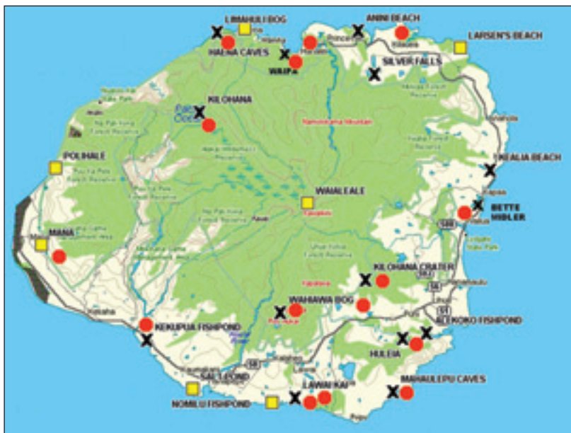
Figure 2. Map of Kauaʻi showing dated paleoecological sites (X), undated sites (yellow boxes), and restoration sites (red dots) that have utilized paleoecological data. Makauwahi Cave Reserve encompasses the Mahaʻulepu Caves site and additional abandoned farmlands.

3), each following guidelines constructed after years of research in palynology, paleontology, archaeology, history, and ethnography focused on the site.