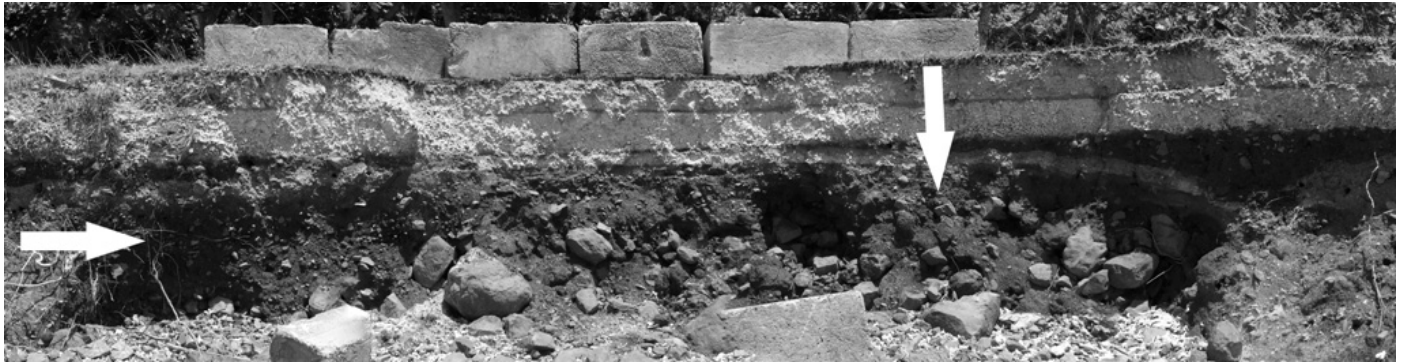
Figure 2. Exposed stratigraphy seen in cutbank between the villages of Utusi'a and Faga'itua. Upper light layers are interpreted as former road beds; lower dark layer (and beach) contain numerous lithics. White arrows point to cultural stratum with abundant lithics.

struction, and at the Āmalu'ia stream mouth, lithics were seen in a stream cut in a highly-disturbed context (unfortunately, extremely heavy rains and stream flooding during this part of the survey prevented recovery of these flakes). At Āsili, a single Type I adze was found along the beach near the stream mouth, and no other lithics were seen nearby; it is possible that this was washed down by erosion farther up the stream. In the stream at Se'etaga, many lithics were found, including preforms and utilized flakes, but these are also likely to have been uncovered and moved by erosion; the tsunami damage in the immediate area was powerful